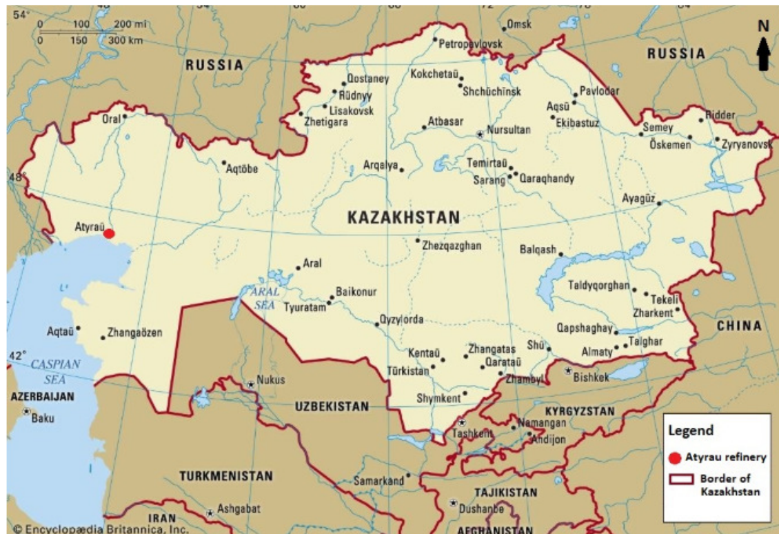
Figure 1: Location of the Atyrau Refinery in Kazakhstan